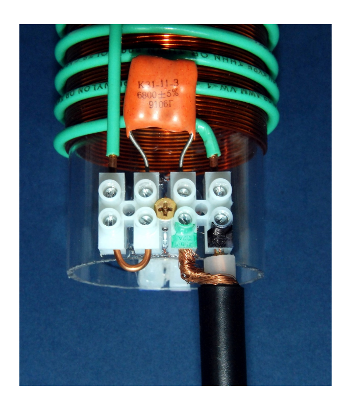
Figure 1 LC31L-ST RF Input Terminal Block

The LC31L-ST has been designed and optimized for use with a 23 foot / 7 meter length of 50-Ohm, solid dielectric insulation coaxial cable such as RG-213 (preferred) or RG-8. One end of the cable will be connected to the RF output terminals of the amplifier and the other end of this cable will be connected to the input connections of the LC31L-ST.