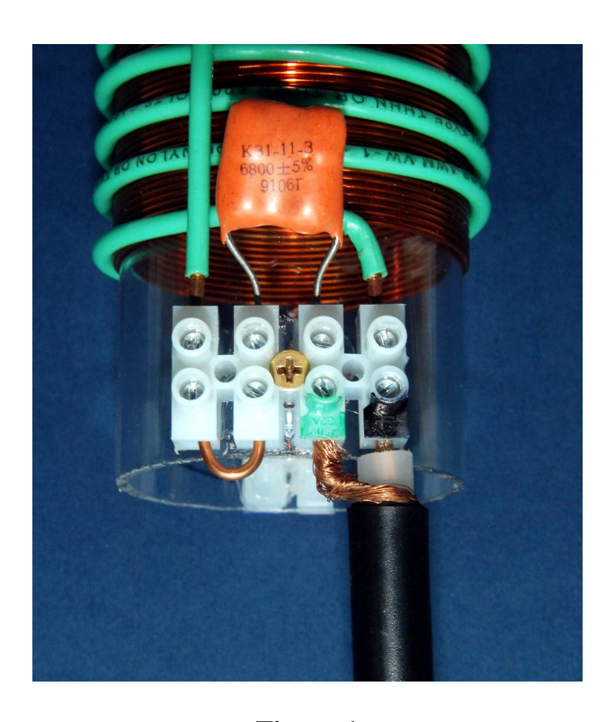
Figure 1 LC31L-BAT RF Input Terminal Block

The LC31L-BAT has been designed and optimized for use with a 23 foot / 7 meter length of 50-Ohm, solid dielectric insulation coaxial cable such as RG-213 (preferred) or RG-8. One end of the cable will be connected to the RF output terminals of the amplifier and the other end of this cable will be connected to the input connections of the LC31L-BAT.